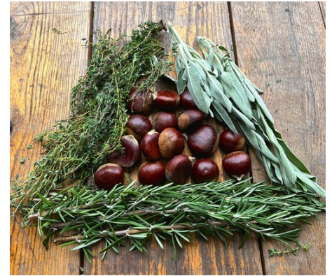
FROM LEFT TO RIGHT: THYME, ROSEMARY, CHESTNUTS, SAGE

Storage Tip - Fresh chestnuts, still in their shells, will keep for about a week in a cool, dry place. To store them longer, place them in a plastic bag - perforated to allow for air circulation - and refrigerate them for up to a month.