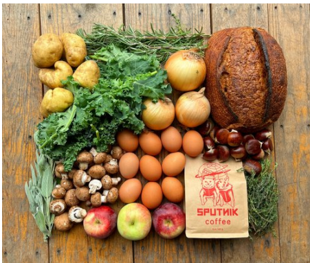
YOUR SHARE THIS WEEK WILL RESEMBLE THIS PHOTO!

Storage Tip - Keep your bread cut side down in a bag on your counter for two to three days. At that point you will want to slice or rip/cut your bread into pieces and freeze for future toast or croutons. Be careful with temperature - you may want to refrigerate bread sooner than later!