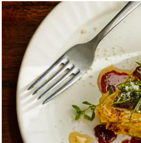
Lillians Whole Stuffed Cabbage