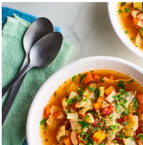
Veggie Cabbage Soup