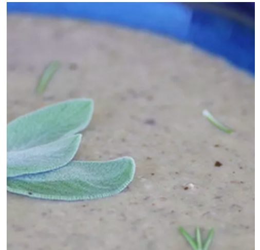
Creamy Mushroom Chestnut Soup