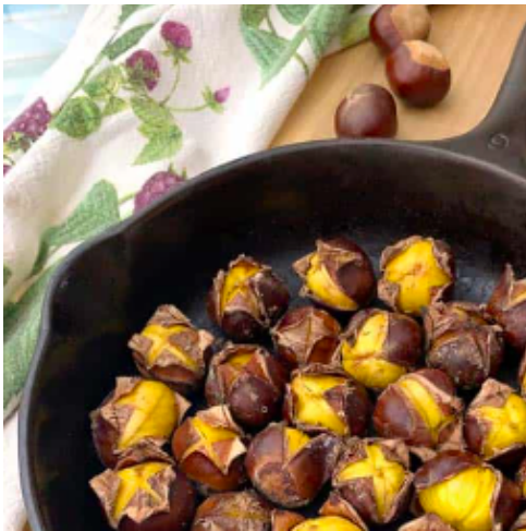
Stove Roasted Chestnuts