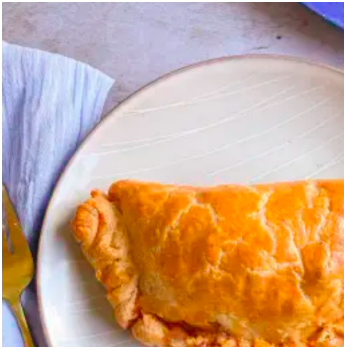
Cornish Pasty (rutabaga, potato, onion)