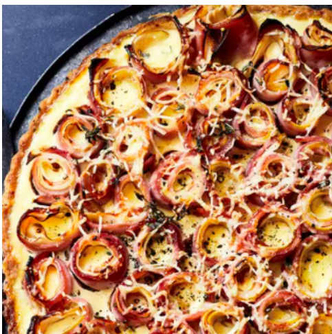
Apple Ham Quiche